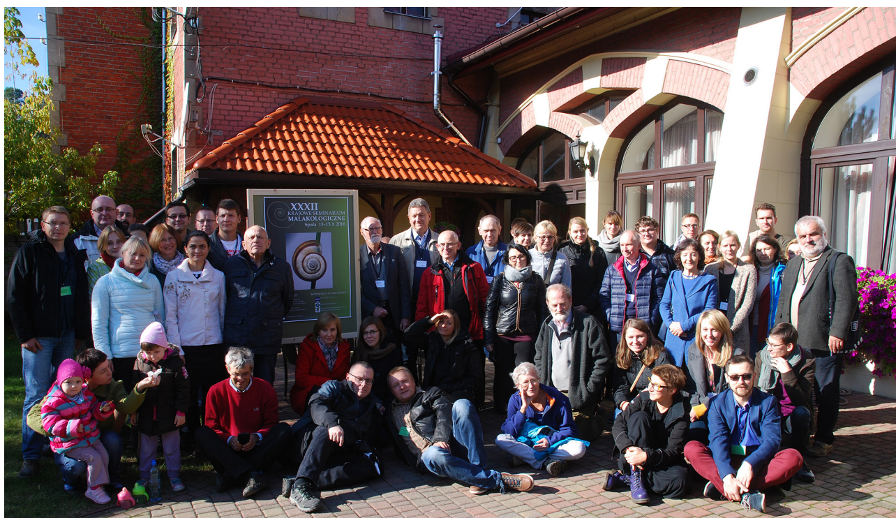
Fig. 1. Nearly all of us, for the youngest generation see bottom left. Courtyard of the Rezydencja Spalska

The organising institutions were the Faculty of Biology and Environment Protection, University of Łódź and the Association of Polish Malacologists.