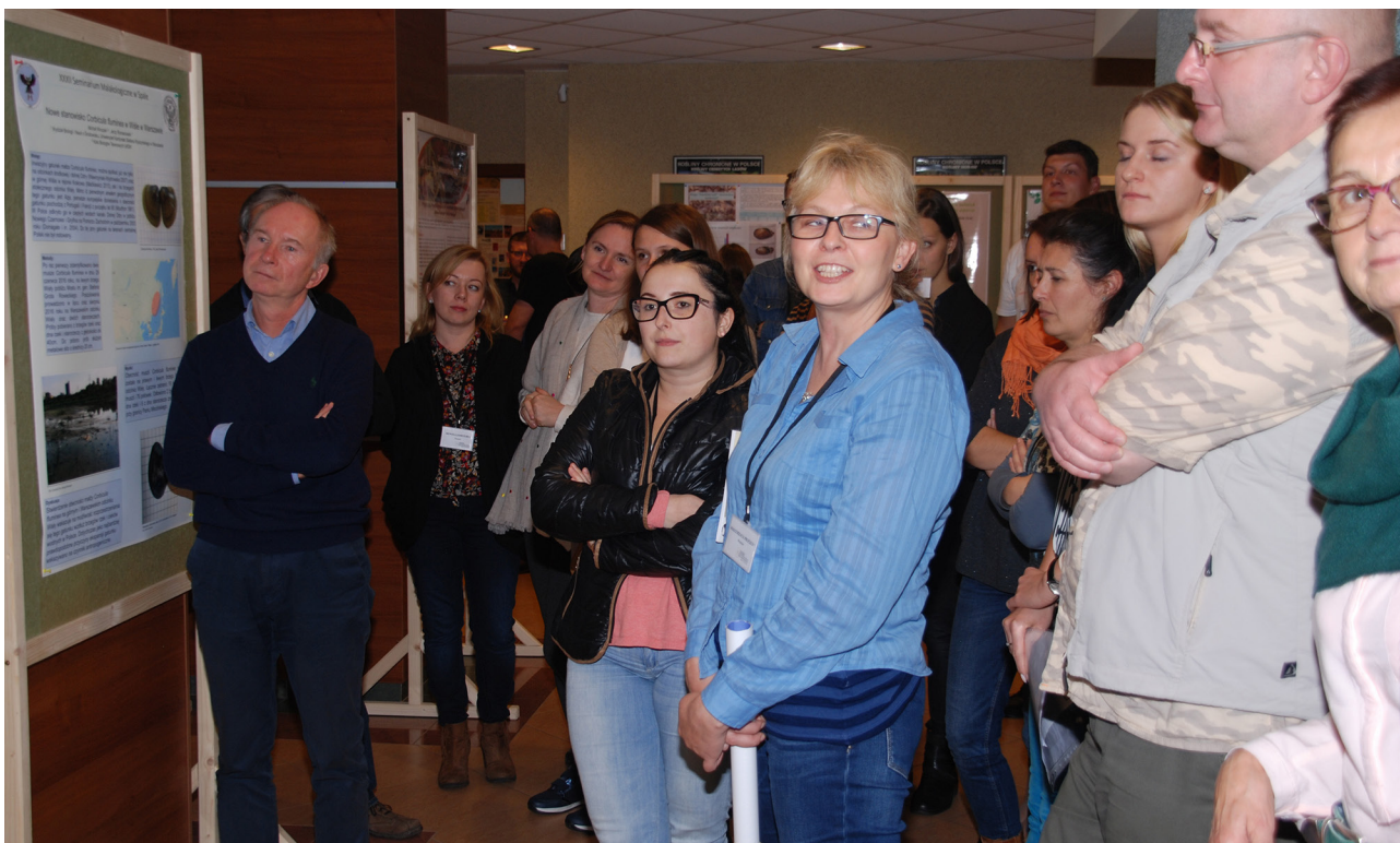
Fig. 3. Poster session.