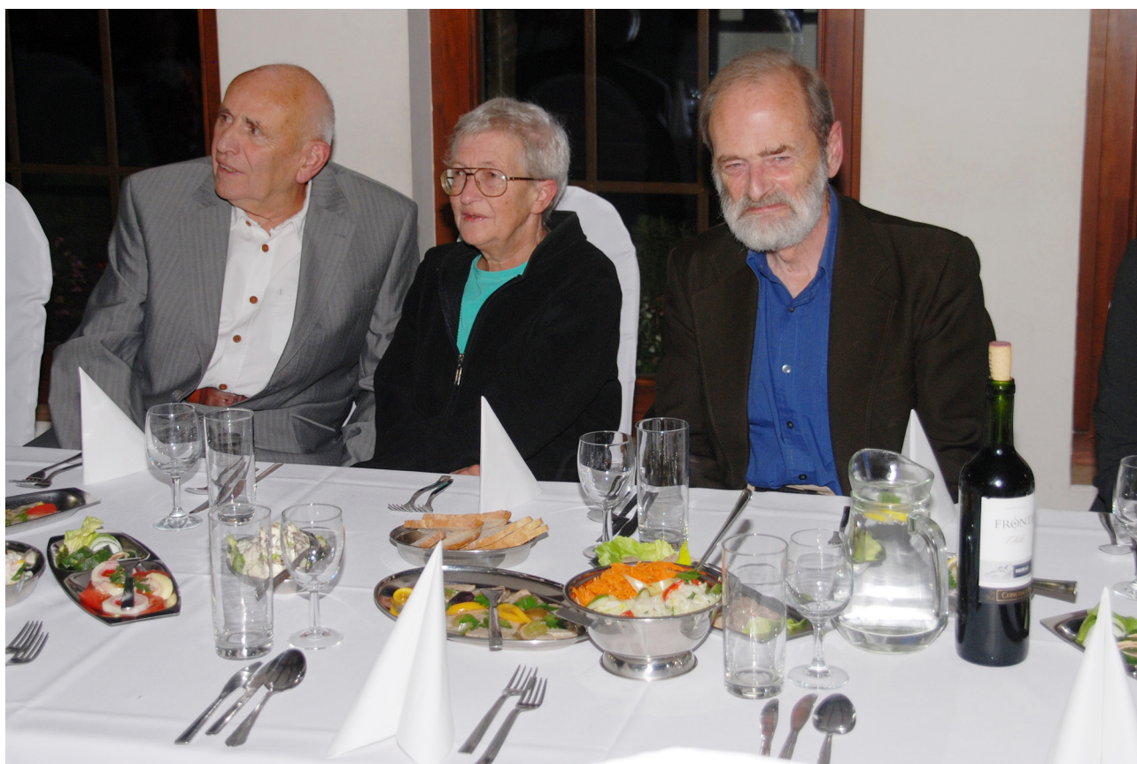
Fig. 5. Banqueting.

mussel: feeding ground for benthophagous gobys or protection for their prey? (JAROSŁAW KOBAK & a multitude of co-authors; this time there was no disneyan Dreissena but instead there was a fantastic fish who tried to attack a mussel bed and couldn't decide), and (even though I say it) one by my ex-students and their molecular friend: "Phenotypic plasticity and absence of reproductive barriers between two morphological forms of Trochulus hispidus (Gastropoda: Hygromiidae)". Among the less serious we liked "What do kids' books tell us about mol-